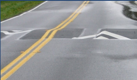
Speed Hump (Approximate locations)